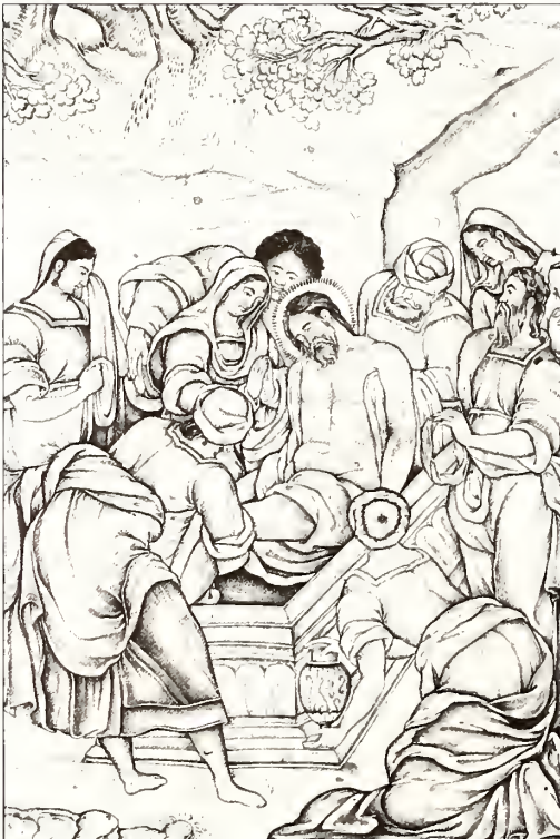
Figure 26. The Entombment of Christ , after Hieronymus Wierix. India, Mughal period, Salim studio, Akbar period, ca. 1599–1605. Album page; ink on paper, image: 16.5 x 11, folio: 31.5 x 20. Free Library of Philadelphia, Rare Book Department, John Frederick Lewis Collection of Oriental Manuscript Leaves M.92